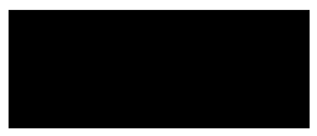
Pittsburgh Gazette masthead of settler and Indian

duce seven hundred copies in a ten-hour day. Of course, a printing press alone was not sufficient to spread the word about this developing community. The Scull and Hall printing shop at the corner of Market and Water Streets thus expanded its newspaper enterprise.