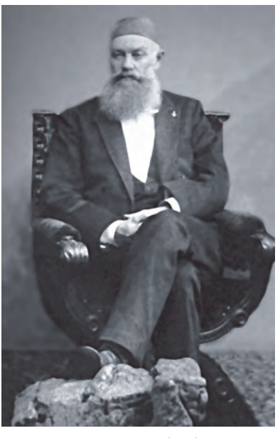
FIG. 1.4. V. V. Dokuchaev.