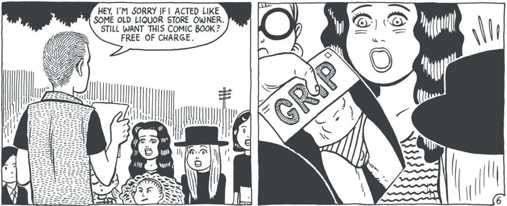
Venus receives a free copy of Gilbert Hernandez's Grip . Gilbert Hernandez, Luba and Her Family , 24. © Gilbert Hernandez.

of Grip because, as he admits, he acted as “some old liquor store owner.” 37 This scene is important for my discussion in this chapter of the book, as it illustrates Gilbert Hernandez’s awareness of the fact that his comics at the time were part of an alternative scene that tried to bypass the market and economic limitations imposed on erotic and transgressive material.