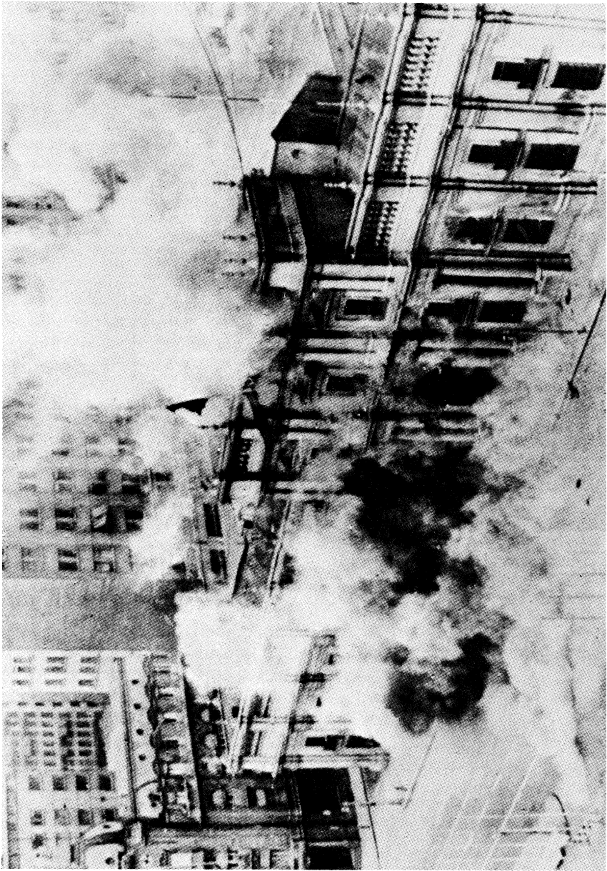
The Chilean presidential palace, symbol of civilian rule, after rocket bombing by the Chilean air force, September 11, 1973.