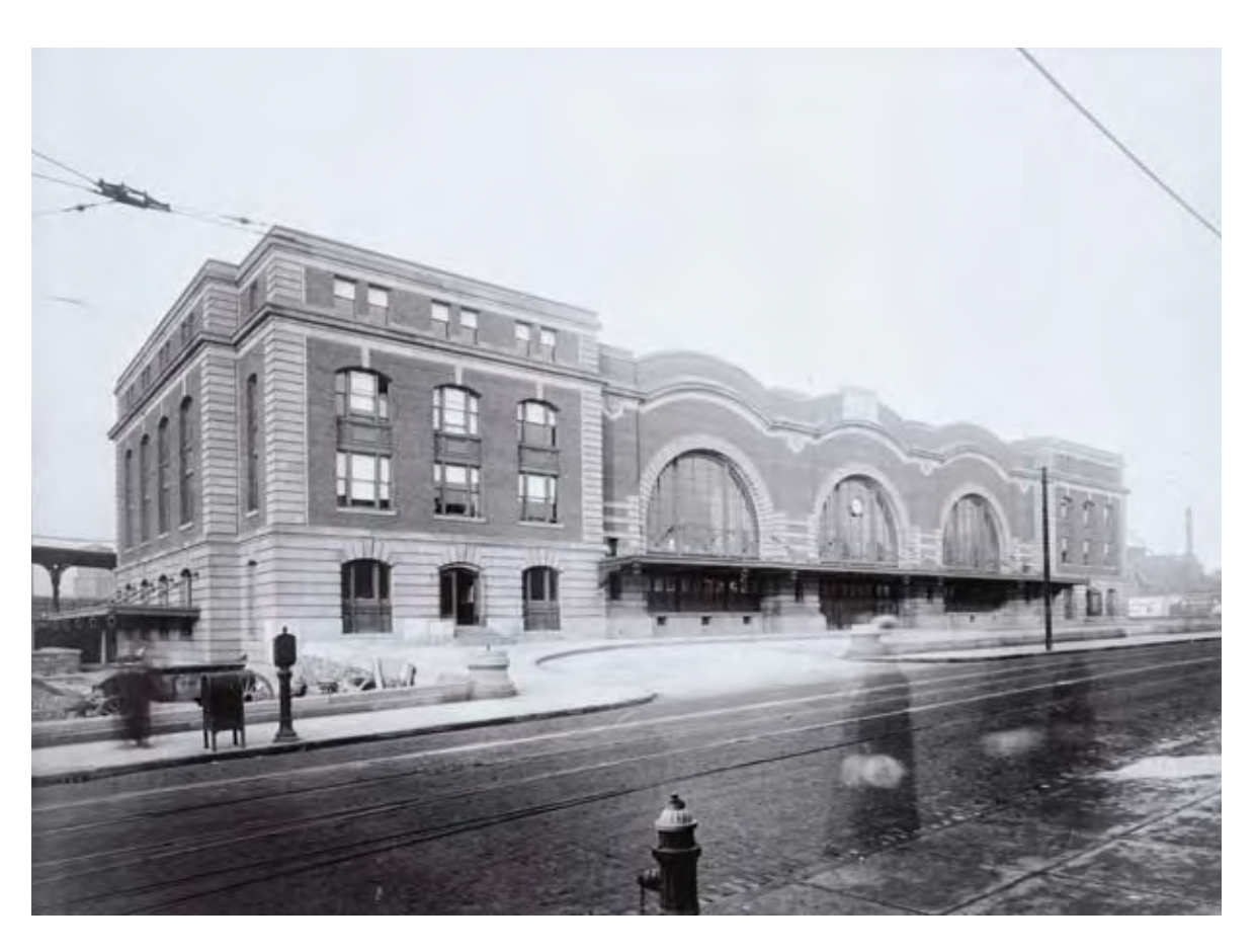
© 2009 University of Pittsburgh Press. All rights reserved.

In the early 1910s, Bragdon came to see modernizing ornament as the most urgent task facing advocates of organic architecture. Traditionally, ornament had articulated social and ontological differences. Whether on clothing, furnishings, buildings, or even culinary dishes, ornament traditionally had marked membership in particular grades and segments of society. It distinguished sacred from secular, aristocrat from bourgeois, male from female, native from stranger. By the early twentieth century, however, ornament had become a means of marking class status and cultural prestige through