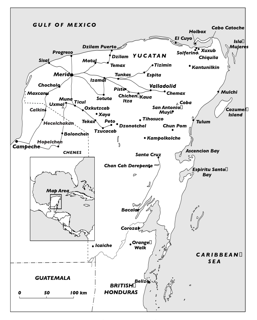
The Yucatan Peninsula

twine. Some locals busily converted their cattle haciendas to plantations of henequen and installed steam power to speed the time-consuming task of stripping fiber from henequen leaves. As they did so Yucatan exported more and more. A nascent sugar industry, destroyed back during the Indian uprising, rose from the ashes, too. Abandoned sugar estates were resettled and restocked, and new mills, boilers, and stills were installed.