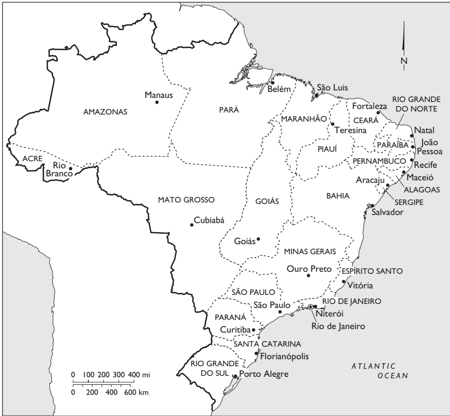
Map 1. Brazil, ca. 1930.

Nacional de Geografia and the Instituto Brasileiro de Geografia e Estatística and the publication of the Revista Brasileira de Geografia produced an extensive body of geographic information about the region. 14 Although geographic studies were intended to aid in the development of mining and agriculture, many geographers also investigated the racial, physical, and psychological characteristics of the populations of the region. Geographic and climatic determinism gave rise to the notion that regional populations were unique, shaped by telluric and climatic forces as well as the vagaries of race and history. Equally important, geographers posited, were the periodic droughts that affected the region, especially in the interior. Perhaps more than any other single event, the so-called Great Drought of 1877 to 1879, which caused an estimated 200,000 to 500,000 deaths, shaped intellectual, public, and political understandings of the region. 15