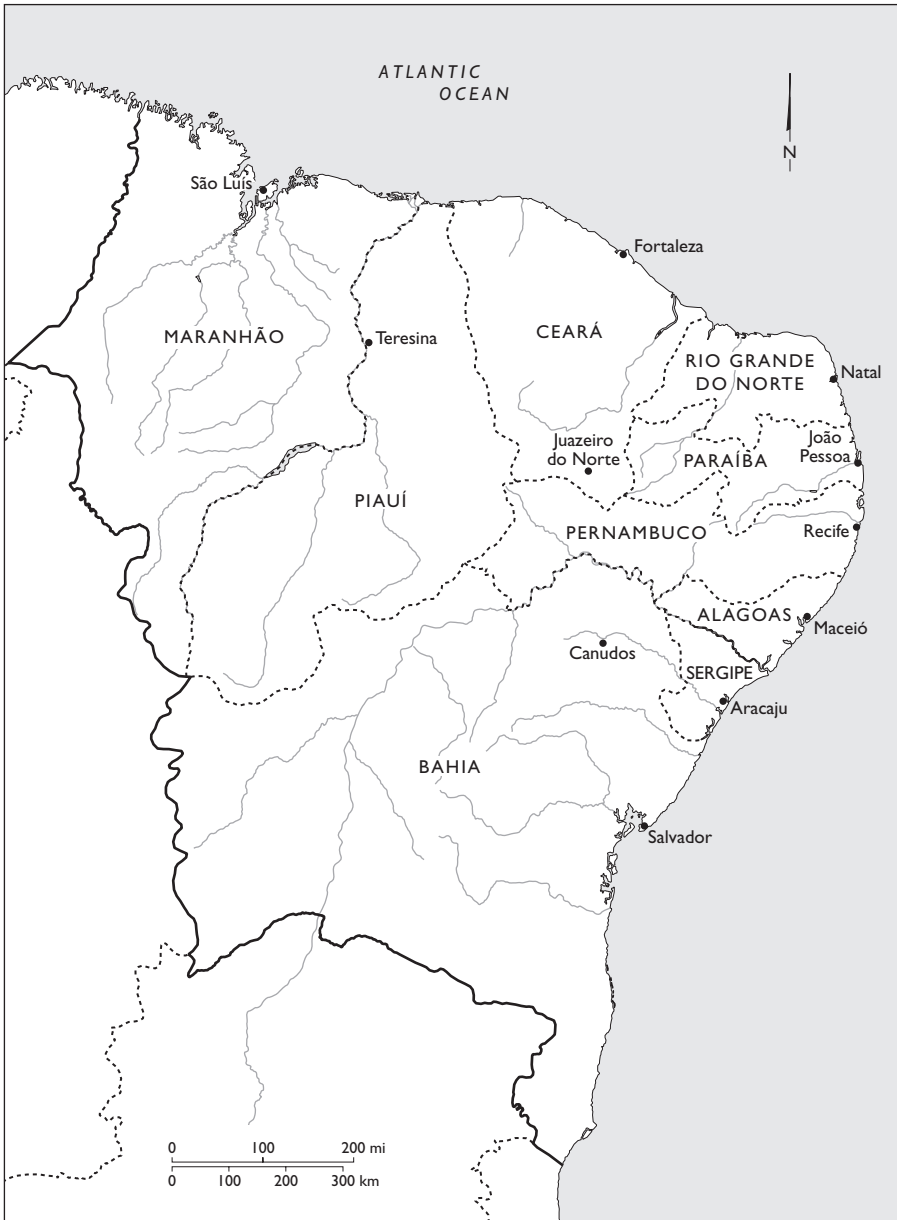
Map 2. Northeastern Brazil, defined by the Instituto Brasileiro de Geografia e Estatística in 1942 as the states of Ceará, Rio Grande do Norte, Paraíba, Pernambuco, and Alagoas. Maranhão and Piauí were included after 1950, and Bahia and Sergipe after 1970.