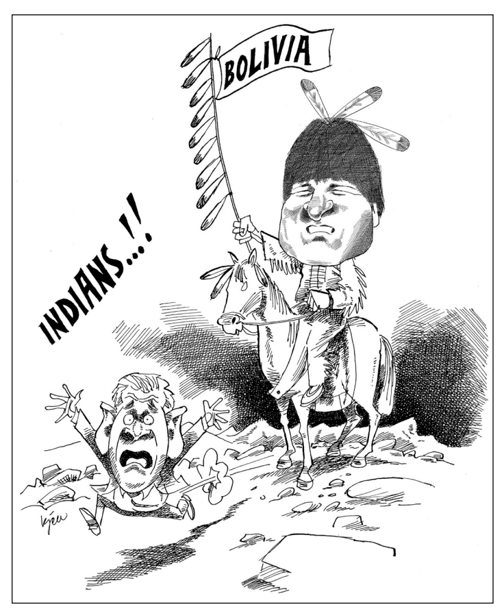
FIGURE 3. "Indian Warrior," a cartoon by Kjell Nilsson-Maki showing Evo Morales. Reproduced by permission from www.CartoonStock.com

However, the contemporary political arena also reflects the centrality of an Indian identity in ambivalent historical national discourses—in this case, an identity best defined through the practices of Creole liberal intellectuals and the Caracollo Aymara provincial elite in the early twentieth century—that kept the Indian question at the center of the national agenda.