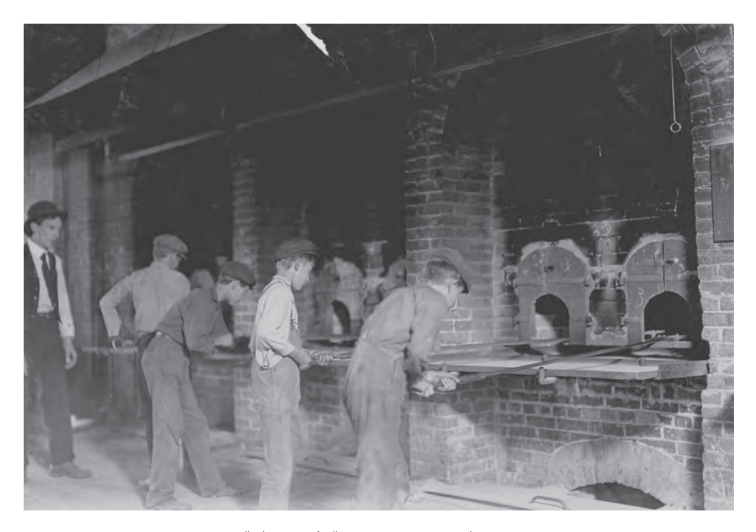
"Glass Works." West Virginia, October 1908

from the gatherer to the blower; the "mold-holding" boy, who stooped at the feet of the blower and repeatedly opened and closed the various metal molds used to give the bottles a uniform shape; the "carrying-in" (or "carrying-off") boy, who transported the bottles back and forth between the blower and the "glory hole" of the reheating furnace, from the blower to the finisher, and then from the finisher to the cooling lehr for the annealing process; and finally the "cleaning-off" boy, who used a small iron tool much like a file to clean off the end of the blowpipe between uses. If the boys were equally skilled at each task, they, like the men, might cover more than one job at a time and they could also trade jobs either during or between shifts. 10 While the men normally remained at their work stations while they performed a particular job, the boys, except for the mold-holding boy (who had to remain at the feet of the master glass blower), scurried around constantly.