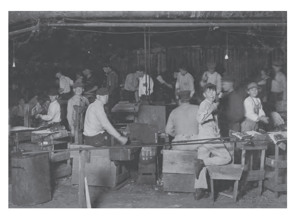
"A midnight scene in More-Jonas Glass Works, Bridgeton, N.J. Four small boys are to be seen in this photo." November 1909

included the "gatherer," the "blower," and the "finisher." The gatherer dipped the blowpipe into the mixture of molten glass. In a series of intricate maneuvers, the master blower then blew into the pipe and began to form the bottle, either free hand or, more frequently, with the use of a mold. During this process the bottle might need to be reheated in the furnace several times before it began to take final shape. When the body of the bottle was formed, it was broken off the blowpipe so that the finisher could complete the neck and top. Then the finished bottle, still very hot, was cooled slowly in a special device called a "lehr oven" to prevent it from splintering. The men were usually equally skilled at each job so that two or three could function as a team and they could switch jobs during the shift.9