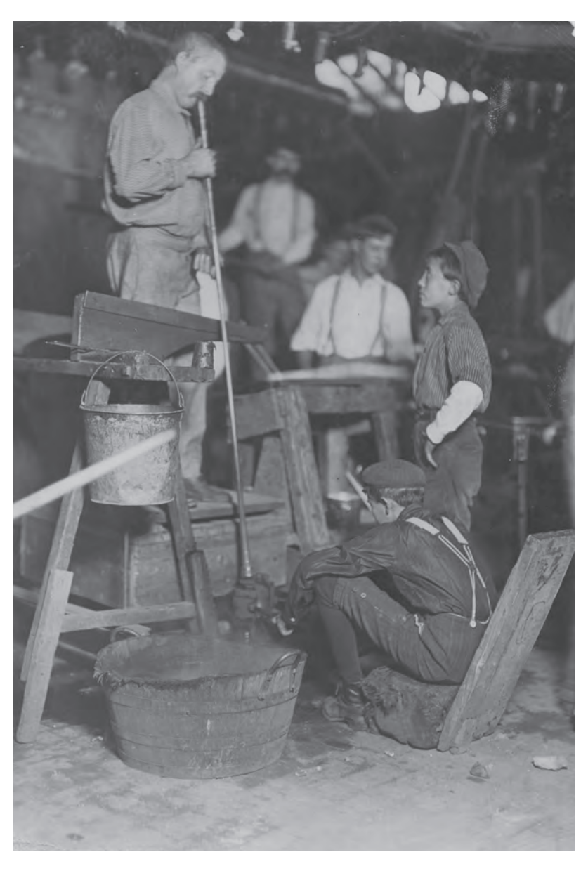
"Blower and Mold Boy, Seneca Glass Works." Morgantown, West Virginia, October 1908