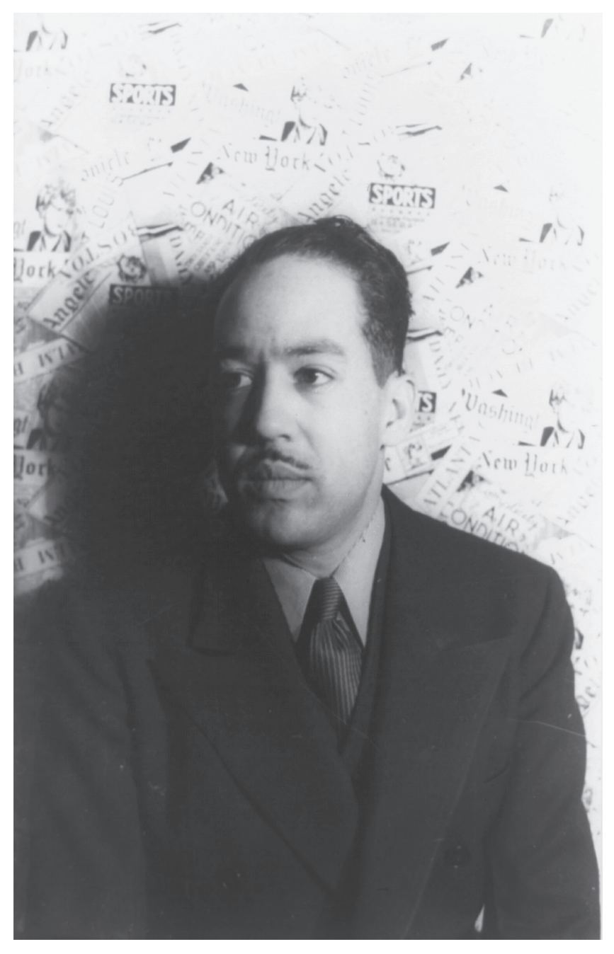
FIGURE 2. Langston Hughes, one-time Washington, DC, resident, poet, and author of "Harlem (Dream Deferred)" in 1951.