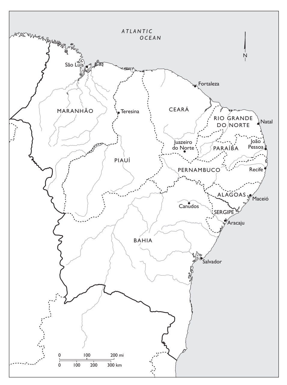
Map 2. Northeastern Brazil, defined by the Instituto Brasileiro de Geografia e Estatística in 1942 as the states of Ceará, Rio Grande do Norte, Paraíba, Pernambuco, and Alagoas. Maranhão and Piauí were included after 1950, and Bahia and Sergipe after 1970.