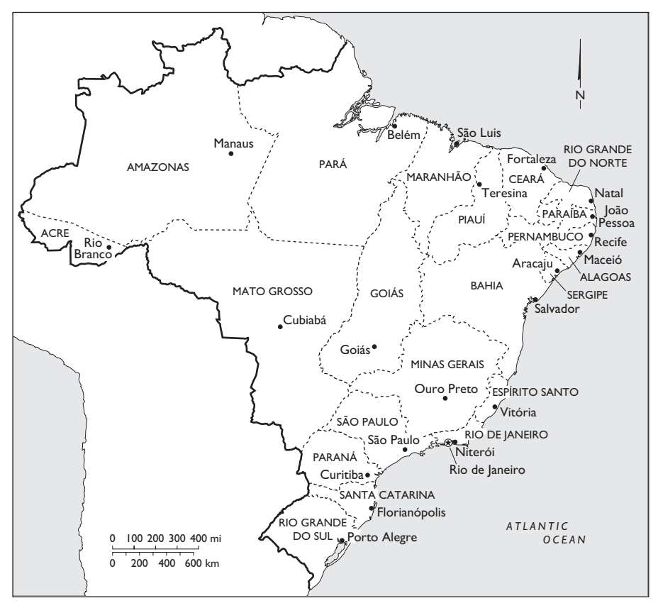
Map 1. Brazil, ca. 1930.

Nacional de Geografia and the Instituto Brasileiro de Geografia e Estatística and the publication of the Revista Brasileira de Geografia produced an extensive body of geographic information about the region. <sup>14</sup> Although geographic studies were intended to aid in the development of mining and agriculture, many geographers also investigated the racial, physical, and psychological characteristics of the populations of the region. Geographic and climatic determinism gave rise to the notion that regional populations were unique, shaped by telluric and climatic forces as well as the vagaries of race and history. Equally important, geographers posited, were the periodic droughts that affected the region, especially in the interior. Perhaps more than any other single event, the so-called Great Drought of 1877 to 1879, which caused an estimated 200,000 to 500,000 deaths, shaped intellectual, public, and political understandings of the region. <sup>15</sup>