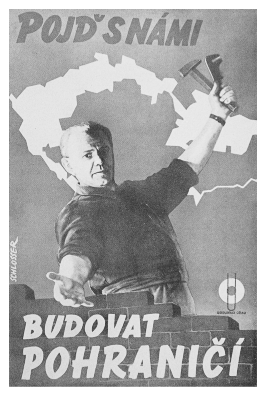
Figure 2. "Come with us to build the borderlands." Settlement Office poster, ca. 1946. Osidlovací Úřad, Zpráva o činnosti OÚ v Praze, undated. Ministerstvo vnitra (MV-T), SUA, ic 1969 sig 265 k 37.