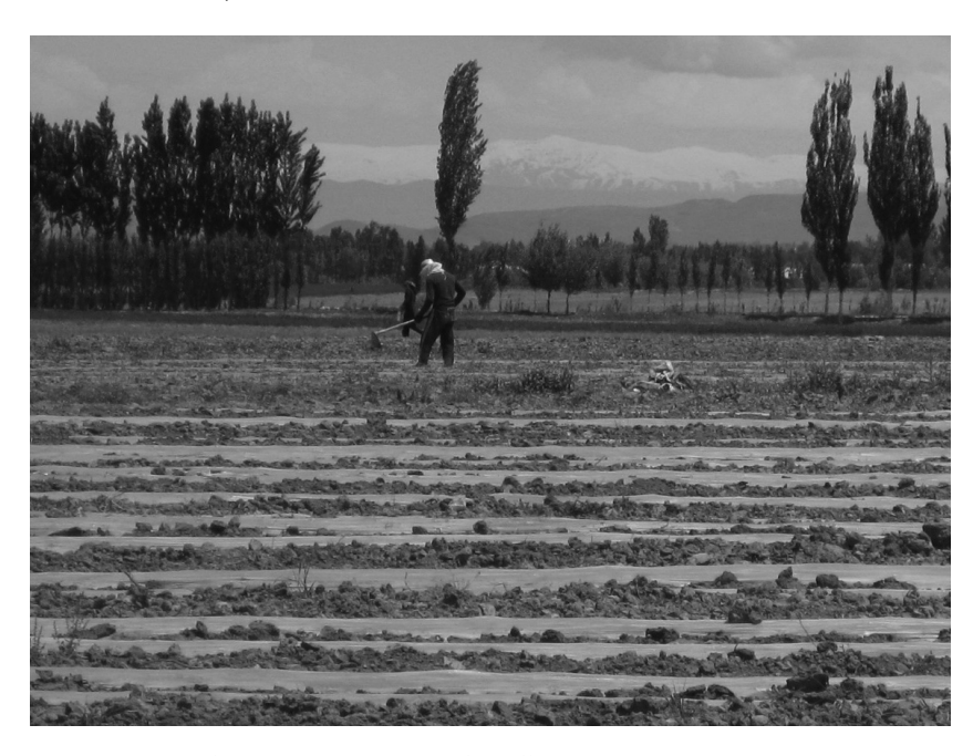
FIGURE I.3. Planting spring crops in the valley, 2012.