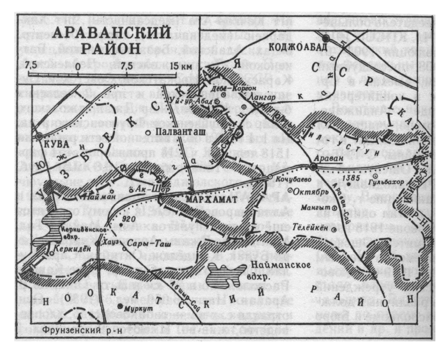
FIGURE I.1. The two parts of Kyrgyzstan's Aravan region (1) were entirely dissected by Uzbekistan's Ferghana oblast around the town of Marhamat (2). This presented no impediments to movement between the two halves until 1999.

and Osh.<sup>27</sup> Scholarly opinion is divided as to whether this process created new nations or recognized existing ones.<sup>28</sup> Hirsch sidesteps these debates by showing how the process of making submissions to the parity commissions working on NTD taught people to participate in a new political sphere.<sup>29</sup> Rematerializations of the boundary helped experts, social scientists, local elites, workers, peasants, and others make the Soviet nations and became integrated into the Soviet Union through the spatialization of ethnicities as national communities.