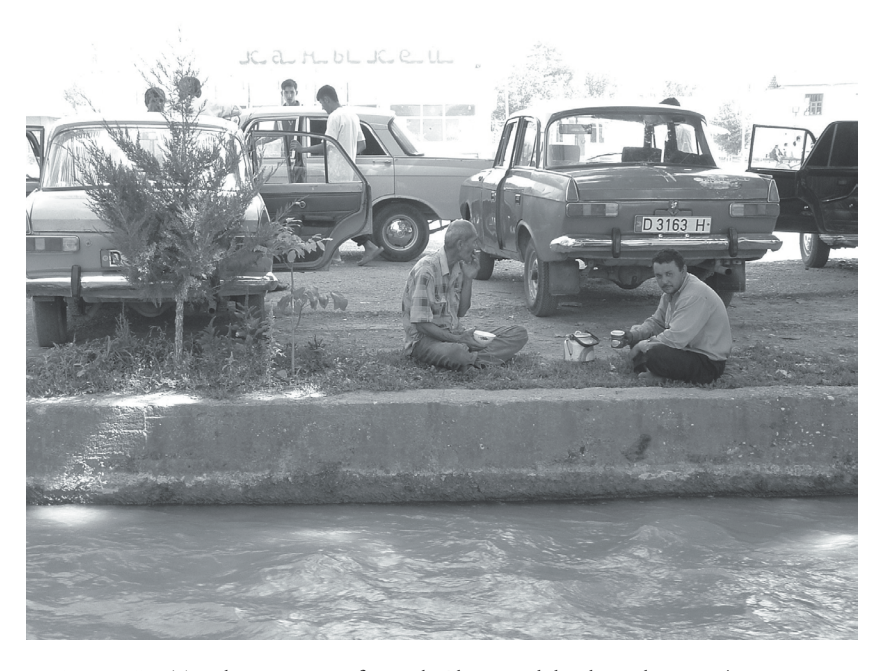
Figure \ I.4. \ Taxi \ drivers \ waiting \ for \ work. \ Photograph \ by \ the \ author, \ 2004.