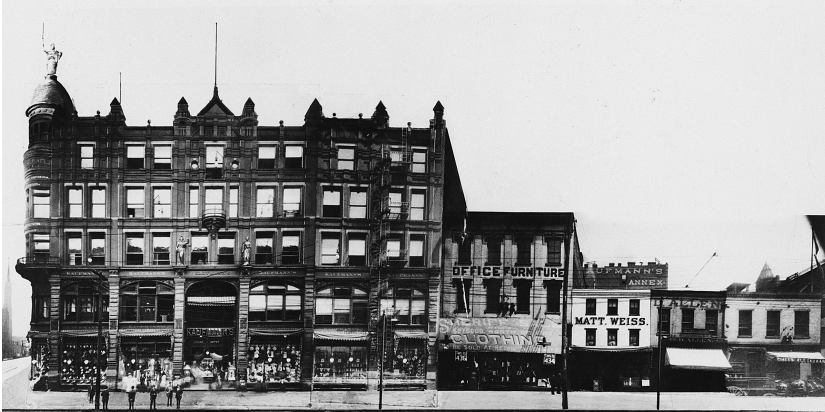
1.9 In the 1880s, Kaufmann's had a statue of Lady Liberty (upper left) as its focal point.