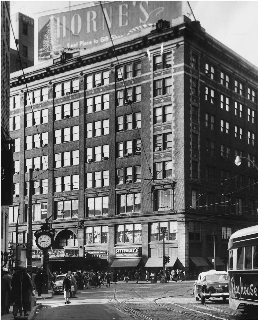
1.8 The Liberty Avenue side of the Jenkins Arcade in 1955, showing a billboard for its next-door neighbor, Horne's.

railroad depot called the Grand Depot. Outside the Kaufmann's store, atop a towering cupola, stood a fifteen-foot-high statue called the Goddess of Liberty, holding a natural gas torch in her hand that "could be seen at night over the entire city." 72 An employee had to go on the roof to light the flame each night. The Goddesses of Commerce and Justice, both eight-foot-high bronze statues, flanked the building's main entrance. The entire building, inside and out, was illuminated by electricity, so bright that "the interior is as bright by night as day," and the exterior lights had "2,000 candle power