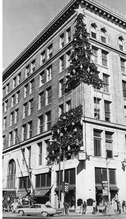
1.6 The Christmas tree display goes up at Joseph Horne's department store, downtown Pittsburgh, in 1979.

Soon, more department stores opened downtown, making it the retail shopping destination, as in many American cities. Max Rosenbaum opened a shop in 1868 on Market Street as a wholesale and retail store. By 1880, he moved his retail business to Market Street and Liberty and then in 1915, opened a new store with two thousand employees at Sixth Street between Penn and Liberty Avenues. 64 A flurry of commercial activity accompanied the turn of the century. In 1904, McCreery and Company opened at Wood Street and Sixth Avenue. 65 In 1907, Russian Jewish immigrants Jacob Frank and Isaac Seder opened what would later be named Frank & Seder at 344 Fifth Avenue, the former location of department