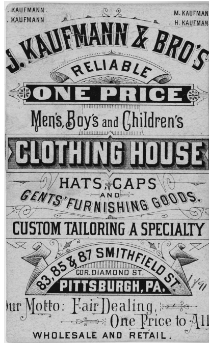
1.5 Kaufmann's advertised its one-price policy, meaning that prices were marked on tags rather than forcing shoppers to haggle with clerks.

As it changed locations, Kaufmann's also revised some of its business practices, reflecting new trends in a burgeoning industry of "department stores." By printing the cost of an item for sale on cards that accompanied merchandise, 51 they could offer goods at consistent prices, an approach pioneered by New York retailer Alexander T. Stewart. 52 Before, salesclerks had to assess, based on someone's appearance, how much a customer could afford to pay for an item, then haggle with him or her over the cost. In an October 26, 1881, newspaper advertisement, Kaufmann's touted the new pricing system: "When we advertise a price, we charge no more." 53 During this profitable decade, the Kaufmanns had caught the wave of a new type of merchandising. According to one source, the phrase "department store"