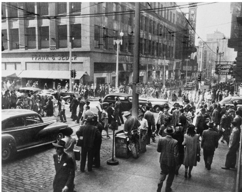
1.7 The bustling corner of Fifth Avenue and Smithfield Street in downtown Pittsburgh shows Frank & Seder's department store.